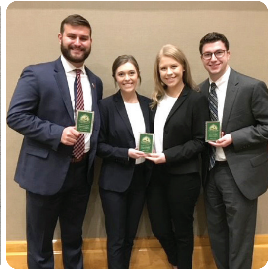
Young alumni panel presentations during professional development.

“A fundamental responsibility of leaders is to educate and prepare the next generation of leadership.