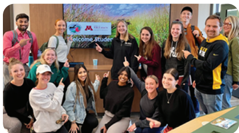
Above: UMN MHA students engaging in the Itasca Ecohealth Interprofessional Experience, where they learned about how ecohealth and ecopolitical environments affect the healthcare landscape.

Overall, the UMN MHA program's commitment to sustainability and social responsibility is a source of pride and inspiration for students, faculty, and alums.