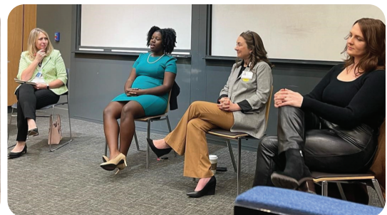
Young alumni panel presentations during professional development.