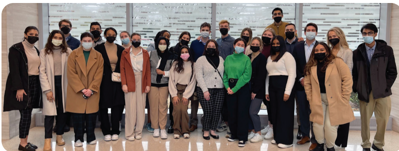
First year students attending a facility tour to better understand performance and quality excellence.