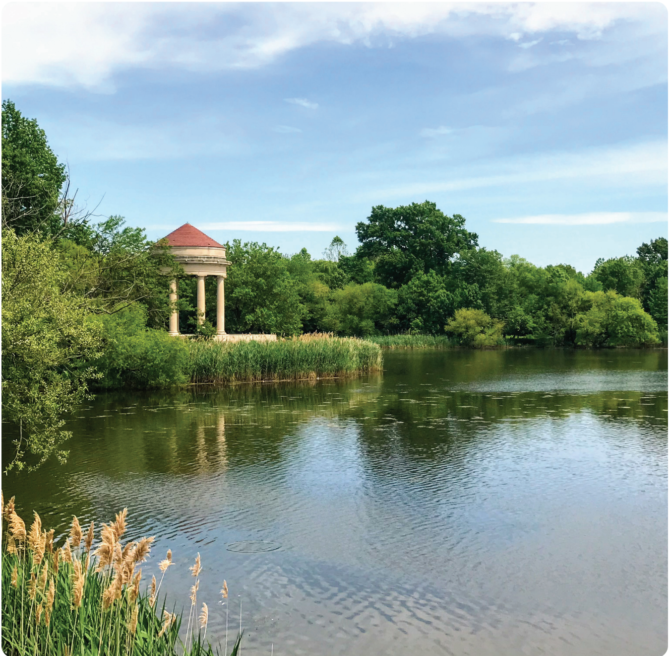
FDR Park in Philadelphia. If you are from South Philly, it is simply known as “The Lakes.”

The CAHME Awards inspired the healthcare industry to join in, inspired foundations to contribute, inspired healthcare management education programs to innovate, and inspired students to know they can make a difference. These stories are examples of the impact of the CAHME Awards. They provide a firsthand witness of the ripples of change in healthcare, their lasting effects on communities, and a passion by our sponsors and by the award winners to advance the quality of healthcare management education.