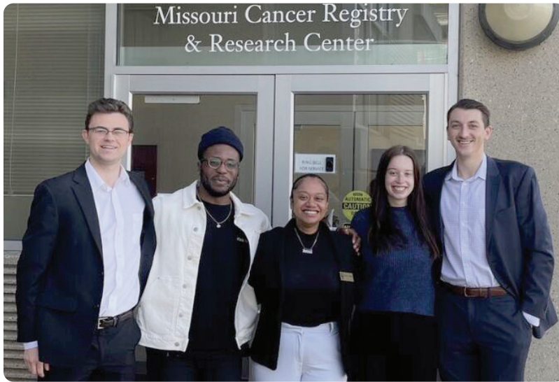
First year students attending a facility tour to better understand performance and quality excellence.