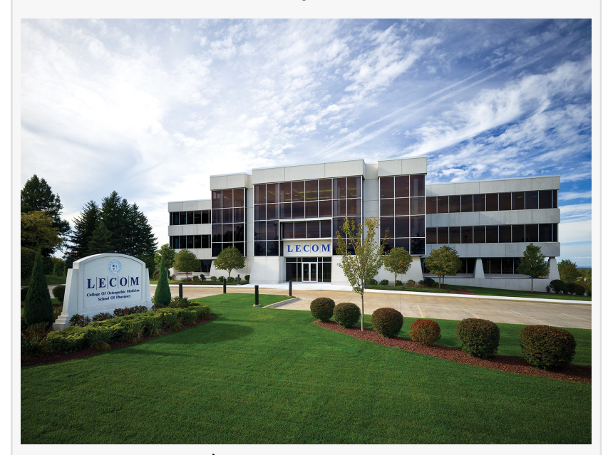
LECOM Campus Photo

CAHME granted the LECOM School of Health Services Administration's MHSA program an initial 4-year accreditation status on May 21, 2025.